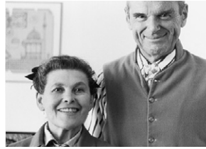
Designers: Charles and Ray Eames