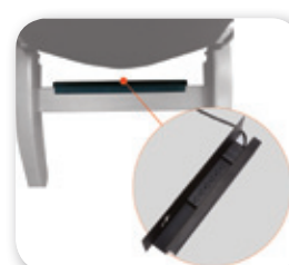
Power Cord Manager