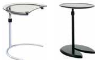
Flexi Table W:21.3" D:16.9" H:21.7"-27.6"